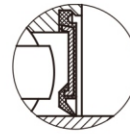
J type seal (Standard)